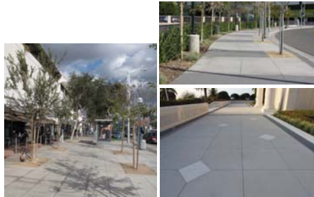
Primary paving will be concrete with a simple scored pattern

Crosswalks The AWG's preference was Duratherm crosswalks (see image at bottom left) for signalized intersections, unless a crossing is required to have zebra stripes for safety reasons. Unsignalized intersections will have continental striping (zebra striping).