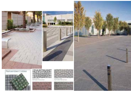
Secondary accent paving will be either stone pavers (above) or precast concrete pavers (below)