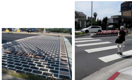
Duratherm pattern (above left) and continental (striping above right). The Duratherm pattern will be determined during final design, and "LOOK" will be integrated to promote crossing safely.