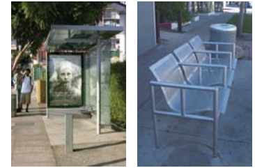
Existing Furnishings West Hollywood is already using a modern Decaux bus shelter with ad panel, perforated metal benches with dividing arms and a perforated metal newsrack corral.